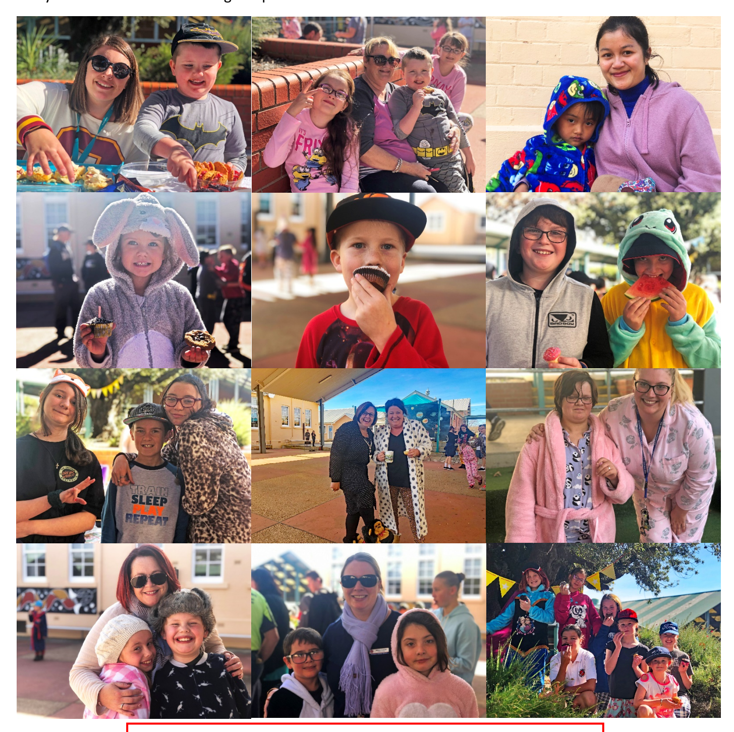
For full image galleries of this week's stories, please visit our website.

The raffle will be drawn next Friday, so if you haven't entered yet, please pop into the office to get your $5 entry for a chance to win some great prizes.